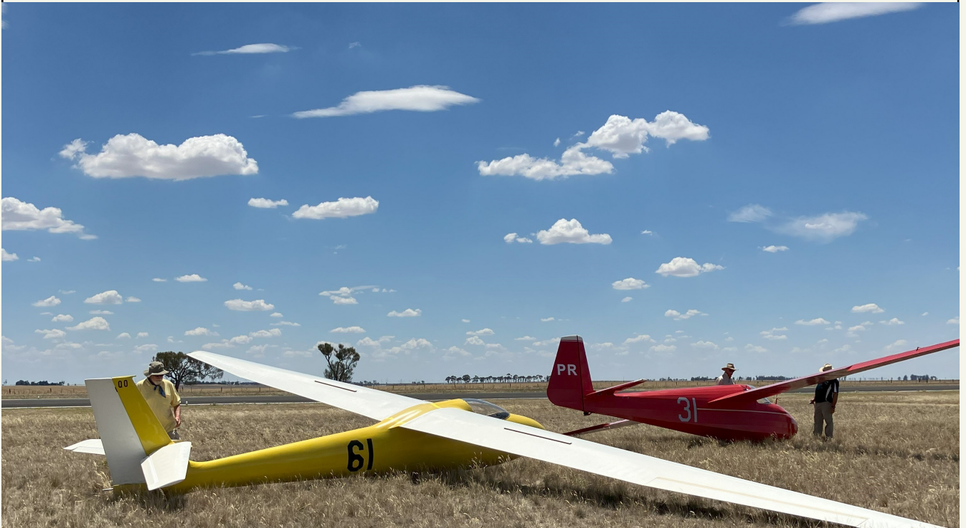
Lining up to take on that sky!