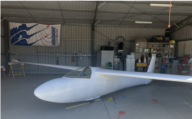
Gerry Elliotts Boomerang VH-GDU on its first rig and weigh post rebuild .